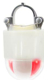
Indicator in flag & flashing status