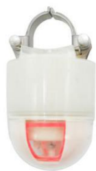
Indicator in ready status

On detection of fault current above the fault sensitivity threshold and for the minimum required duration the JJZ-FF-C indicator will respond both by mechanical Flag Indicate, and flashing, high-power LED indicate.